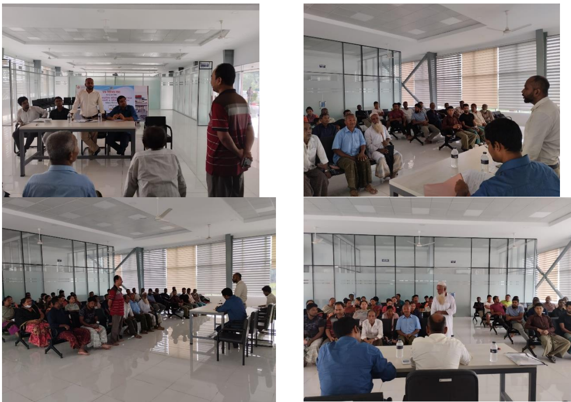
Figure-2: Photos of Consultation